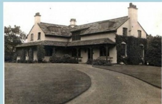
How Watling Gate used to look

Watling Gate are also holding an AGM meeting on Thursday 20th November 7pm-8pm at AWAH. This is open to the public to come and share their views.