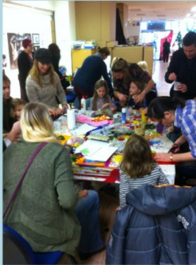
Snapshot of the workshop